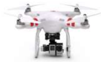
Fig 5. A commercially available product for aerial photography in media

Media businesses, such as film and motion picture industry, newscasters, and professionals could operate a UAS that shown to achieve spectacular aerial images or live-streaming videos shot. This flying platform is capable of generating high spatial resolution photos in cases where a conventional manned helicopter for aerial footage does not exist, or for areas that cannot be reached by aircraft or plane. Drones also assist in aerial advertising and commercial imaging and an illustrative example is shown in Fig. 5.