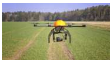
Fig 6. A product for monitoring crop's health

With increased frequency, these devices can support activities evaluation of crop's health (Fig. 6), agricultural surveys, fend off pests. Farmers are permitted to survey drone-generated maps to recognise farmland of crop variation and subtle changes with the Digital Terrain Model. UAS assist in estimating root-causes of damage (nutritional stress on corps) and offering solutions, pasture performance in considerable detail for future verification. Additionally, farmer experts use satellites to monitor crop health below the cloud level from large scale to small scale palm tree counts and coconut oil yield and are able to conduct irrigation and drainage models with thermal cameras.