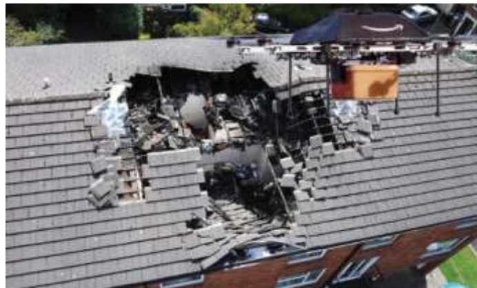
Fig. 4. Drone assisting insurance claims monitoring

Of the special interest for construction industries this tool gets a big picture view and video so as to archive the development of a building or a project in progress. Drones help in distinguishing any security deficiencies, regulatory and safety compliance issues. Any industries that require high accuracy surveys, such as the environmental data or chemical and petroleum spill monitoring can have great opportunities using a UAS for ongoing surveying vast amounts of farmland. Industry can easily monitor a work in progress, detect the material left or small changes, achieving a quickly 3-D model view and keep track of large facilities. A good example of topographic survey of surface or volume determinations that take place can be a conventional station operating 2 days for 24 hours per day on a land of 16,000 tones while for the same product, the drone would operate only 2 hours.