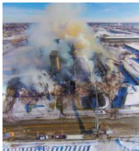
Fig. 2. Aerial view from firefighter drone in order to rescue for victims or alive

Firefighters can operate drones to find if anyone alive is caught in a building on fire. The noteworthy example is shown in Fig.2. They can assist firefighters in safely accessing building on fire, and they perform a navigation to coordinate a not dangerous traceable flight path through the fire. Moreover, unmanned vehicles deals with forest fire monitoring and automatic route flights.