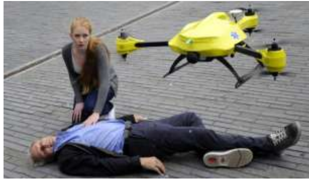
Fig. 3. The ambulance drone