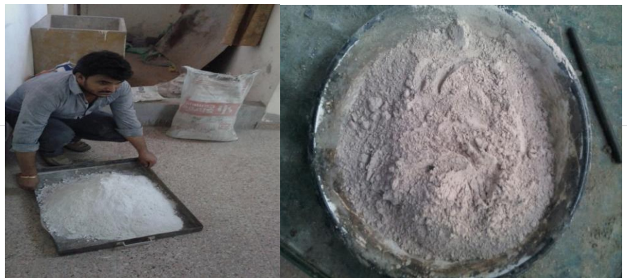
Fig:1 Marble slurry