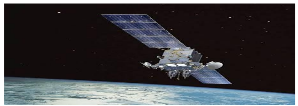
Figure 1: A typical Communication Satellite

Russia launched the first satellite into orbit called the Sputnik 1in 1957 while the United State of America (USA) launched two experimental satellite called Echo 1 and Echo 2 in 1960 thereby setting the pace for development in the area ofsatellitecommunication. There are over 2000 communication satellites in the world today, each launched in to orbit above the earth's surface by different organization to operate at a given range or bands of frequencies in order to eliminate interferences of radio signals. Figure 1 shows a typical communication Satellite in an orbit above the earth.