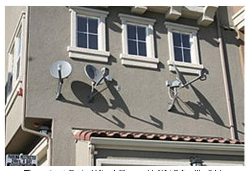
Figure 1: A Typical NigeriaHouse with VSAT Satellite Dish