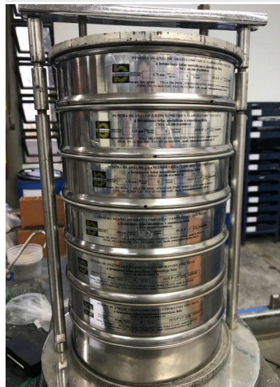
Fig. 2. Sieves used for particle size testing.

After grinding, at the Civil Construction Materials Laboratory (LMC), a mechanical sieve shaker and two sets of 6 hollow sieves (Fig. 2) were made available by LCVMat, following NBR 5734, with different mesh openings, in order decreasing, then, from the most widely spaced to the most closed mesh, isolating each different grain size, of sizes: 3.35 mm; 1.70 mm; 0.85 mm; 0.60 mm; 0.425 mm; 0.30 mm; 0.21 mm; 0.15 mm; 0.106 mm; 0.075 mm and 0.053 mm.