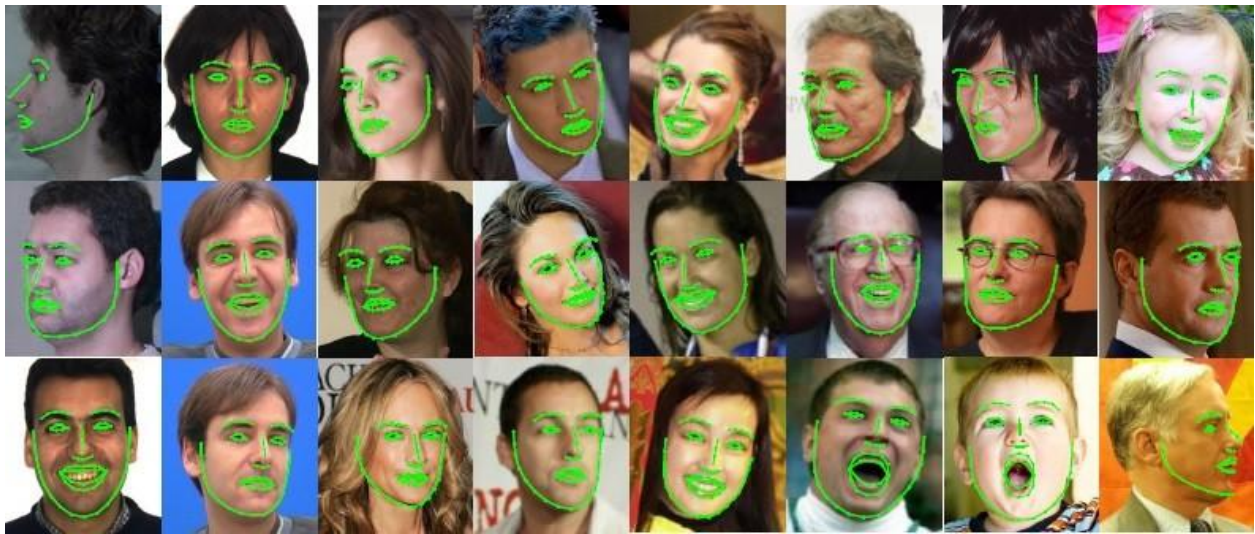
Fig 4 , Possible face positions

The position takes the form of 68 landmarks. These are points (X and Y coordinate) on the face such as the corners of the mouth, along the eyebrows on the eyes, etc.