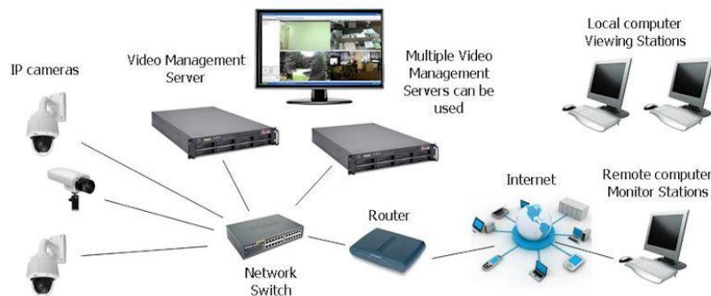
Fig.1 Video surveillance system

Video surveillance is a system of cameras arranged in a space to be monitored. These cameras are linked to a computer system that allows the processing and analysis of the data received. The first video surveillance system was designed in Germany in 1942 by Siemens AG for the purpose of observing rockets. Since then, video surveillance systems have evolved considerably. Data analysis and integration is becoming more automated and requires less human intervention.