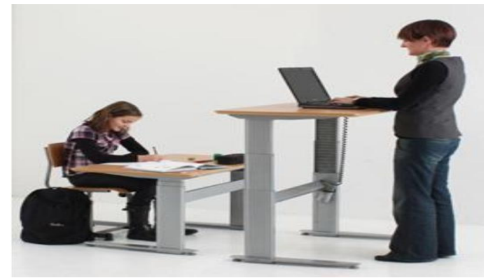
Fig.1. Comfort comparison during sitting & standing at work.

The following comfort issues we will discuss ------