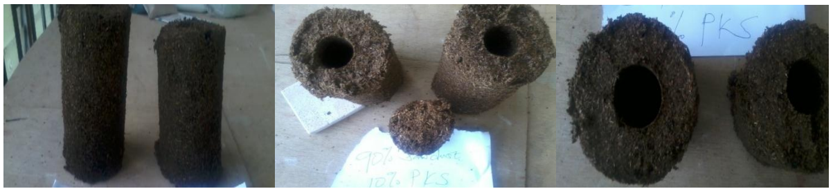
Figure 3: Samples of the Produced Composite Biomass Briquettes