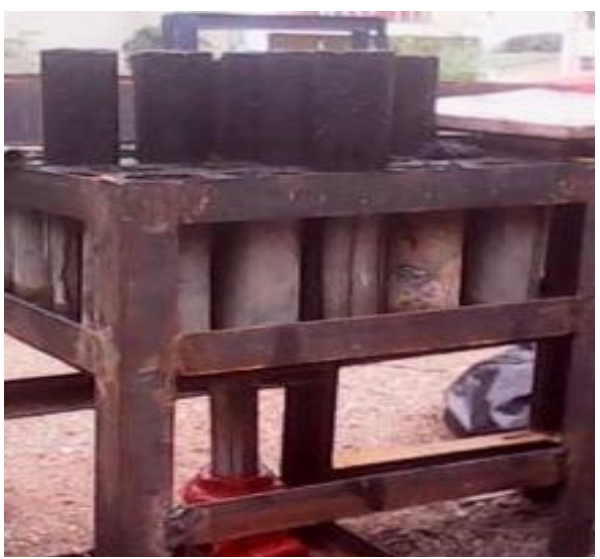
Figure 2: Briquette Ejection Stage

Sawdust (SD) and Palm Kernel Shell Powder (PKSP) samples were mixed in different mixing ratios of 85:15, 75:25, 65:35 and 55:45 of PKSP to Sawdust respectively and 100% of both Sawdust and Palm Kernel Shell Powder, the mixture was mixed with an already prepared cassava starch in a constant mixed ratio of 25% by weight were produced. The starch and the composite biomass samples were well mixed without forming a mixture with high moisture content because the formation of a mixture with higher moisture content due to excess addition of water reduces both the durability and density of the briquette [9]. The biomass-binder mixture was hand fed into the moulds and compacted to form the briquettes after which they were sun dried to constant weight. The produced composite biomass briquettes are shown in the figures below