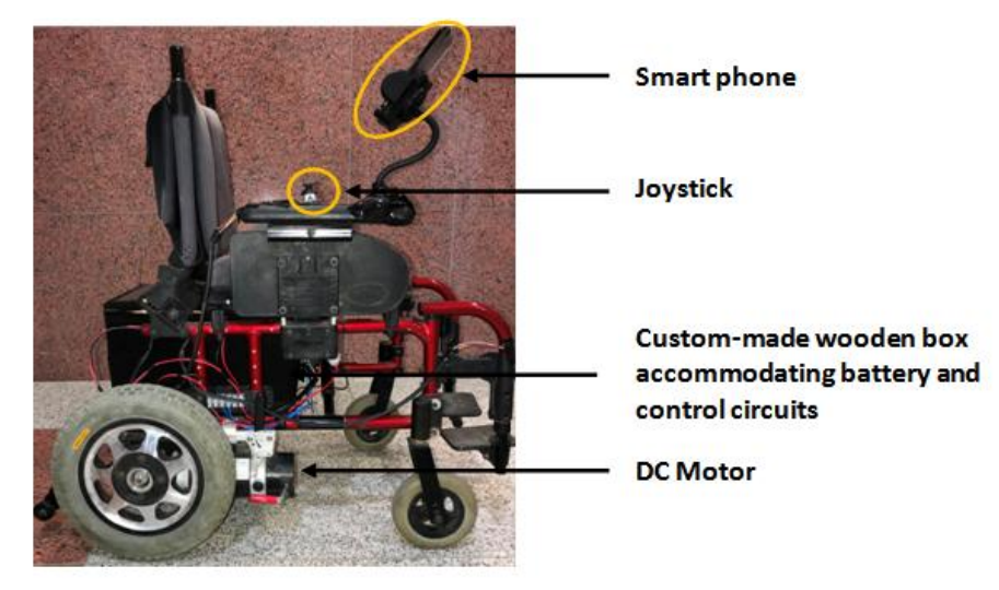
Fig. 1. Electric Wheelchair with assemblies

The core of this project is the wheelchair. Due to several advantages of electric wheelchair over the traditional manual type, an used electric powered wheelchair is considered in this work. The wheelchair is assembled with two D.C. motors; each of 24 Volts, 250 Watts, an electrically chargeable battery, and two driving wheels coupled to the motor shaft through a 28:1 gear system and two balancing freewheels. This wheelchair did not have any efficient peripheral devices such as motor control system, sensors and controlling mechanism. We designed all these peripherals and then assembled on the wheelchair. The assembled wheelchair is shown in Fig. (1). The battery, control circuit boards and separate d.c. power supply source for the circuits are fixed in a custom-made wooden box that is placed under the seat of the wheelchair.