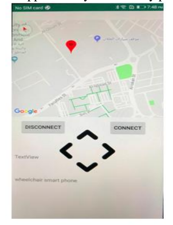
Fig. 3. Screenshot of Android Mobile App for wheelchair navigation

A user-friendly Android based mobile application software was developed and tested by comparing with another mobile phone. The screenshot of the App is shown in fig. (3). The mobile App is GPS based and can browse the Google Map in which the destination to travel can be selected. Below the map, two press buttons are created from the software programming. One button is indicated as "CONNECT" and another as "DISCONNECT". When the wheelchair user is seated comfortably then the CONNECT button can be activated making the microcontroller initiate the motor driver for electrical supply from the battery to both motors. The wheelchair can be stopped by using the button DISCONNECT. These are included in the App itself avoiding use of mechanical ON/OFF switch which may be inconvenient to the disabled. Four arrow marked buttons are also created on the front of the app through the programming. These are used to navigate the wheelchair along the track shown in the map window to reach the desired location. It has been tested ten times for different locations to confirm consistency from repeatability. All the test are performed in our university campus. These tests have been performed by operating the app remotely without any person seated on the wheelchair.