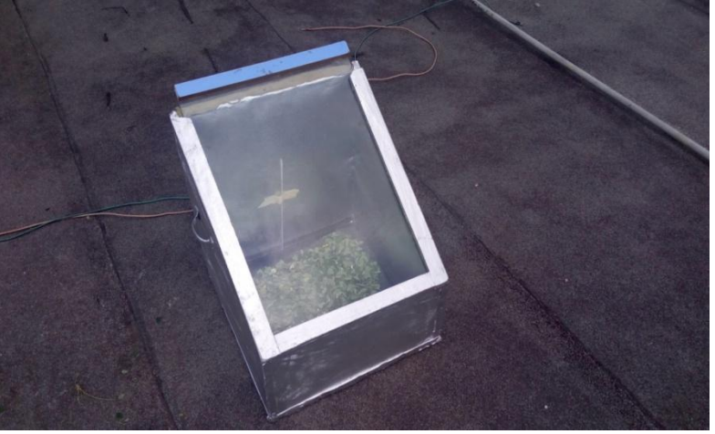
Plate 1: Oven Drying of the Moringa Leaves in Progress