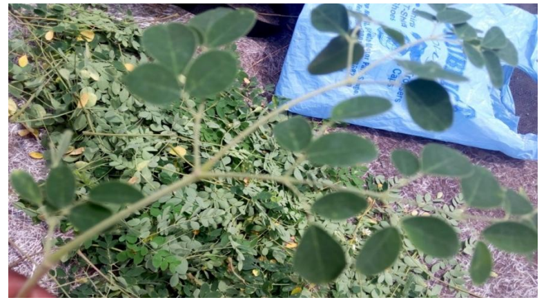
Plate 2: Moringa Leaves