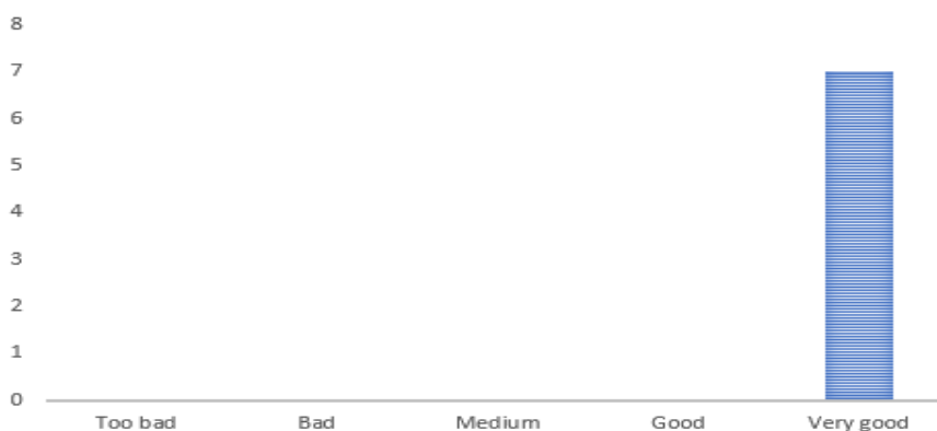
Figure 2 - Impact on equipment operation and maintenance after adequacy of NR - 12 - permanent access means.

As for the percentage of impact on equipment operation and maintenance, as shown in figure 2, it was observed that all consider it very good.