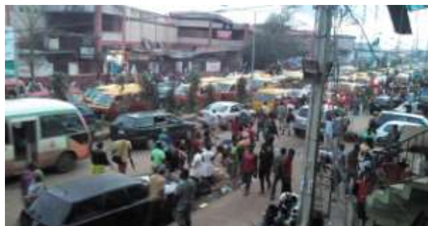
Figure 5: Oba Market Road leading to Eki-Oba and Yanga Market