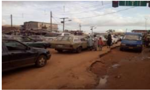
Figure 4: West Circular (Television) road leading to Eki-Oliha and Eki-Uwa