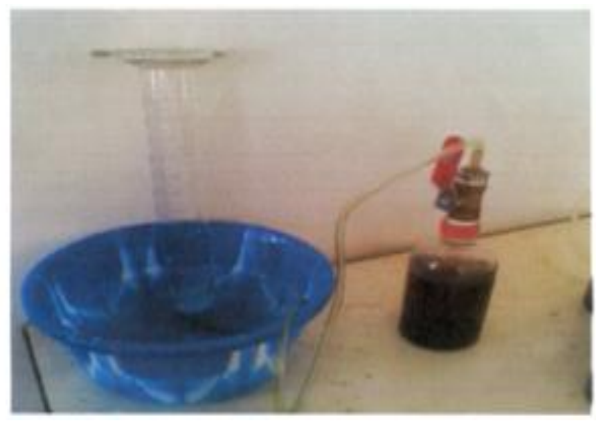
Fig 2: Measurement of the biogas using water displacement method.