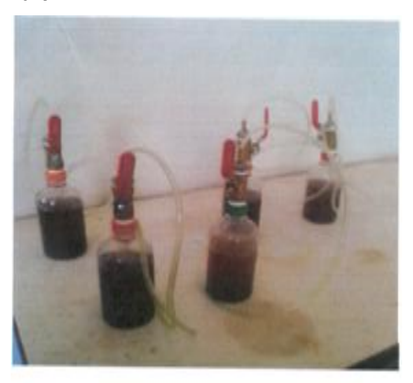
Fig 1: Digester set up

The biogas produced from each of the sample in the 500ml bottle was measured by water displacement method. The water diplacement method of gas collection is a method in which gas is allowed to replace water at equal volume of water displaced and this was used to determine the volume of gas produced daily. The control on the digester was released for the evolved biogas to get into the measuring cylinder and the volume of water displaced equals the volume of gas produced. While a tyre guage metre was used to measure the volume of inflated tyre by taking the reading on the guage and subtracting the initial weight of the deflated tyre which equals the volume of gas produced.