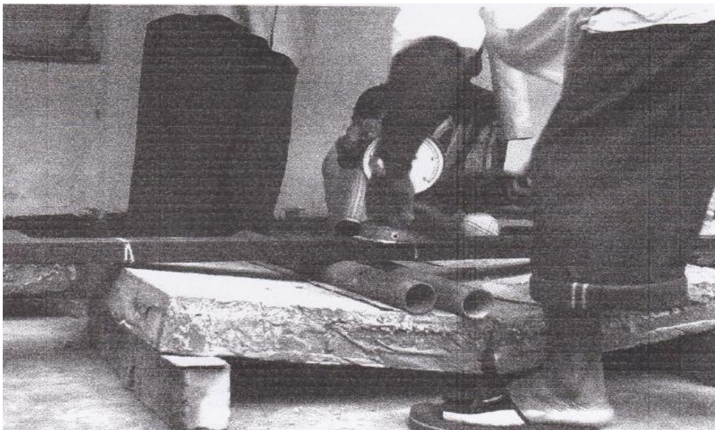
Figure-4: Testing of Slab

After finished all the arrangement, the hydraulic jack was pumped slowly. The reading was recorded when the slab just broken. The weight of bamboo, hydraulic jack, steel rectangular plate, pipe etc was taken and adding this with recorded load, the total load was got. After that all calculation was performed.