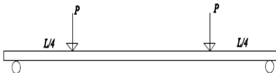
Figure-2: Application of Loading