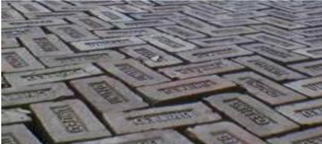
Figure-1: Typical Laying Pattern

Therefore in this study low cost housing masonry slab of various parametric were constructed and tested. Parameter included – brick line, span and filler. Figure 1 shows one of their typical laying pattern and Figure 2 shows the loading arrangement for the test of slab.