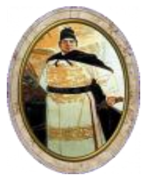
Figure 2: Zheng He.