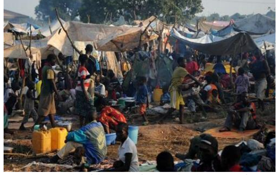
Figure 5 : Central African Refugees in the east of Cameroon

It is the same, the Chinese Ambassador to Cameroon Mr. Wei Wenhua the April 9, 2015, who presented the sum of 20 million CFA francs to the Cameroonian Minister of External Affairs Prof. Pierre Moukoko Mbonjo for food has more than 245,000 Central African refugees located in the east of Cameroon because of the crisis actuates Miss. [19]