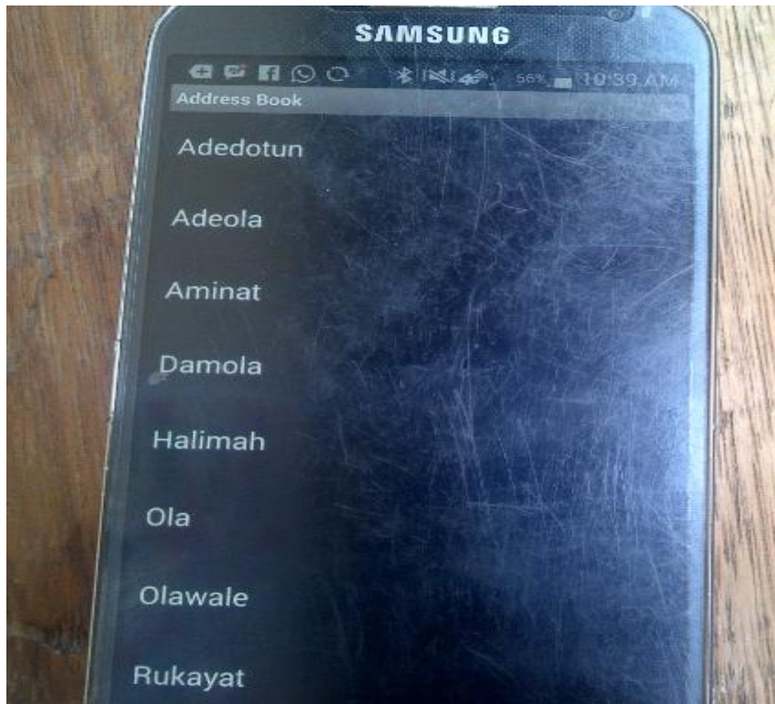
Figure 1.7: Result Output

Figure 1.6 and 1.7 are the output information that will be displayed after saving the contact to each field. As the mobile phone user click on any of the name, the information that is already saved in the SQL LITE database will be displayed for easy retrieval