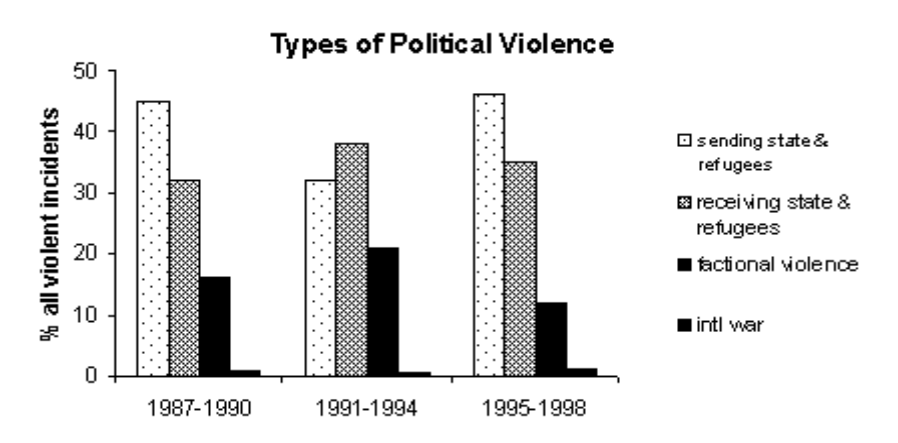
Chart 2: Types of Political violence

Chart 1 depicts special case issue on 42 women &children repression tribunals. It is clearly shown that from 2009 to 2013 there is a lot of change in 2009 it was around 25000 & in 2013 it was around 42000.