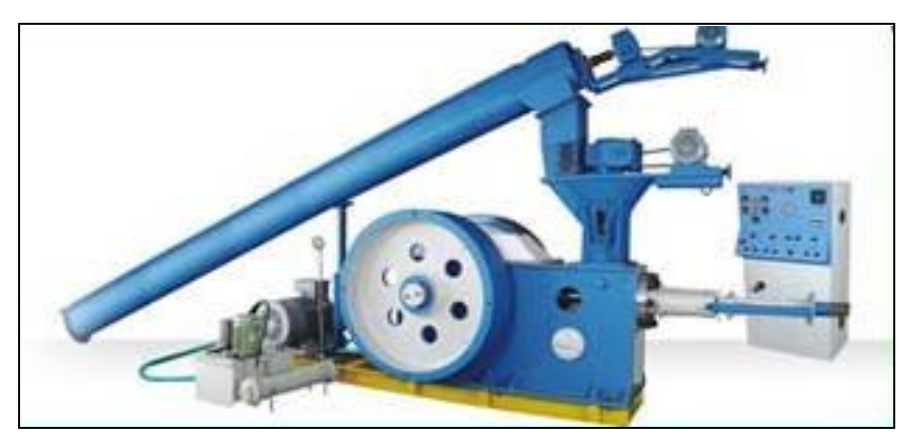
Fig.2 Reciprocating Type Machine

(MJ = Mega joules. 3.6 MJ equals 1 kWh.)