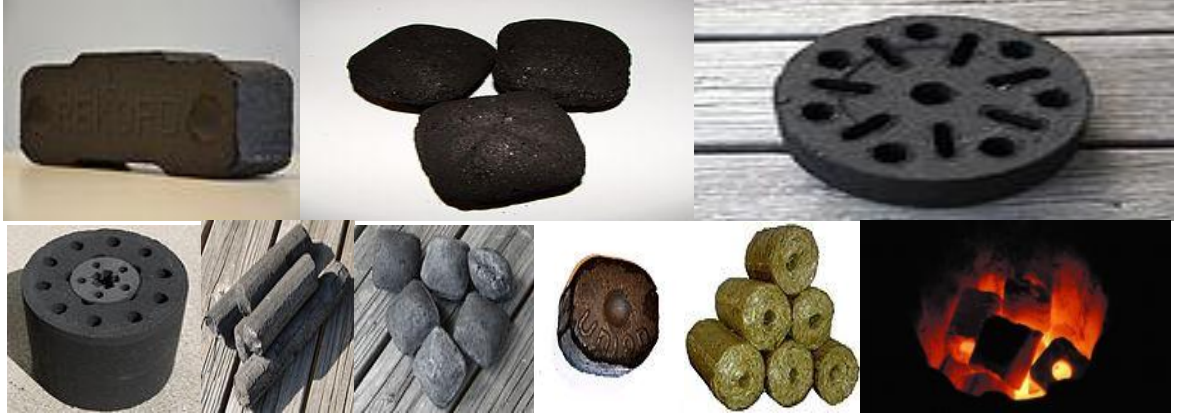
Fig. 1 Different types of Briquettes