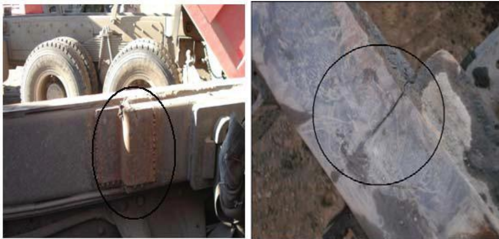
Figure 2 Fatigue crack of the sub-frame

The stress analysis is important in fatigue study and life prediction of components to determine the highest stress point commonly known as critical point which initiates to probable failure, this critical point is one of the factors that may cause the fatigue failure. The magnitude of the stress can be used to predict the life span of the chassis. The location of critical stress point is thus important so that the mounting of the components like engine, suspension, transmission and more can be determined and optimized. Finite Element Method (FEM) is one of the methods to locate the critical point. Safety factor is used to provide a design margin over the theoretical design capacity. This allows consolidation of uncertainties in the design process [3]. Chetan et al. [5] reviews various factors affecting the fatigue life of a structure like cyclic stress state, geometry, surface quality, material type, residual stresses, size and distribution of internal defects, direction of loading & grain size.