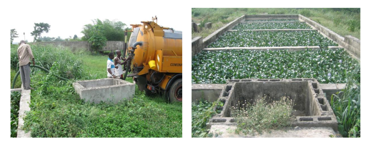
Plate 1 shows tanker dislodging wastewater into the treatment chamber while Plate 2 is the water hyacinth (Eichhornia Crassipes) beds showing baffle arrangement at opposing edges.