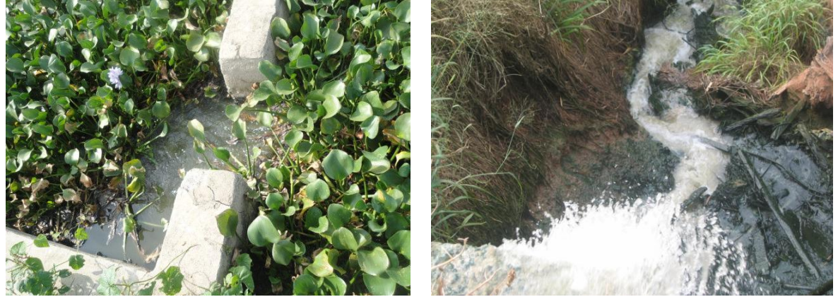
Plate 3- shows water hyacinth treating wastewater and Plate 4 shows effluent discharging through the outfall into the thick vegetation valley.

Grab samples of the raw influent and treated effluent from the existing water hyacinth reed bed were collected and analyzed in the laboratory for its BOD<sub>5</sub>, Faecal coliform, pH, temperature, COD, Suspended Solids, Total Solids, Nutrients and Heavy Metals. Variation of influent and effluent parameters (physical, chemical, bacteriological and physico-chemical characteristics) was determined.