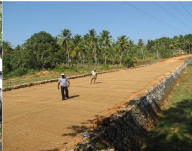
Fig.4 Shows the laying of coir geotextiles along Nj ekkadu - Panayara road