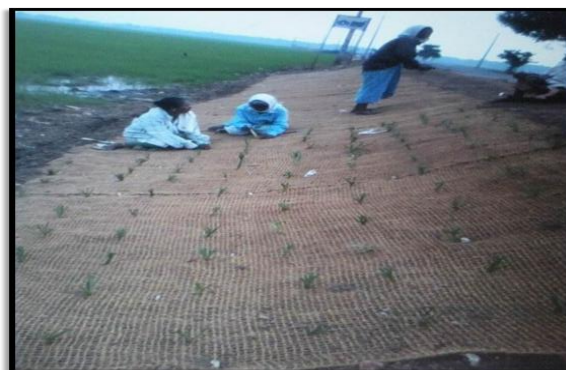
Fig. 5 Shows laying of coir mats in progress on road embankment from Gurupuram to MLA Bridge under MGNREGS

NATPAC initiated evaluation of performance of coir geotextiles laid road in Kindanagra - Kumarangiri road about 1km length. Traffic volume plying through the road is very low (ADT 800 PCU) and also it attracts reasonable amount of truck traffic during the harvest season. An exhaustive condition survey and BBD survey was done to evaluate the functional and structural performance of the road. A control section of 1Km was also taken along the road stretch to compare the performance of roads laid without coir geotextiles. Summary of BBD and IRI values are given in Table 3 and 4.