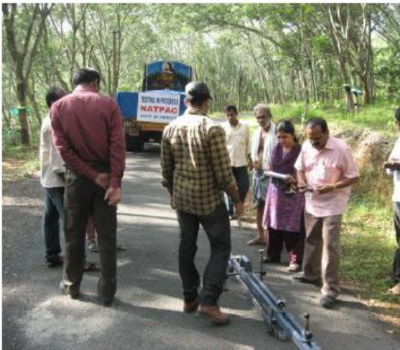
Fig. 3 Pavement evaluation done in Attukal - Pampadi Road (2012)