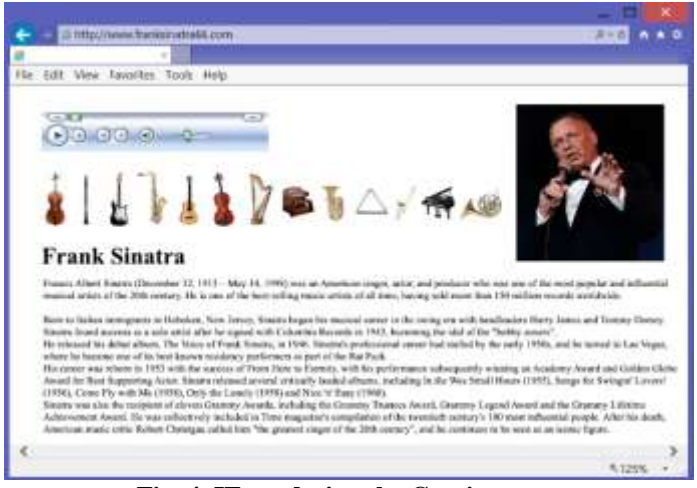
Fig. 4. IE rendering the Carrier page

The carrier web page along with the carrier audio file are hosted on a public domain on the Internet namely "franksinatra66.com"; thus making it exposed to search engines and part of the Surface Web. Figure 4 shows the carrier web page when accessed using a regular browser such as Internet Explorer.