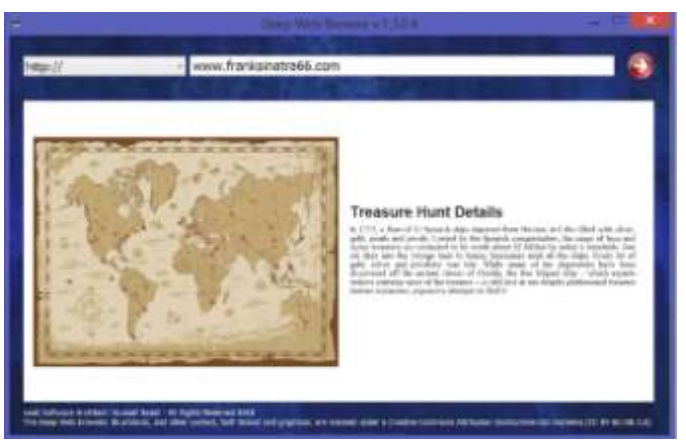
Fig. 5.Deep Web browser rendering the Carrier page