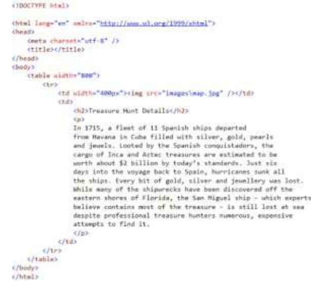
Fig. 2.The HTML code of the Secret Web Page