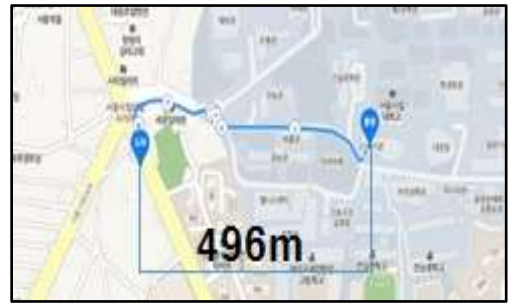
Fig 1 Assuming initial access to bus stop