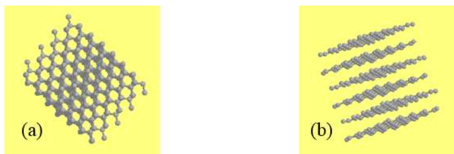
Figure 1. (a) Diamond structure and (b) graphite's layered structure [12].

These unique properties of diamond are explained by its covalent bonding between each nearest neighbor C atoms. The coordination number for carbon is determined by its characteristic sp^3 hybridization bonding in which the four outer-shell electrons of the carbon atom are shared with adjacent atoms in equally spaced directions. Just for comparison the graphite structure, also composed only of carbon atoms, presents strong sp^2 hybridization bond on the hexagonal rings but between the layers weak Van der Waals forces account for the graphite's friable nature and application as a useful 'dry' lubricant.