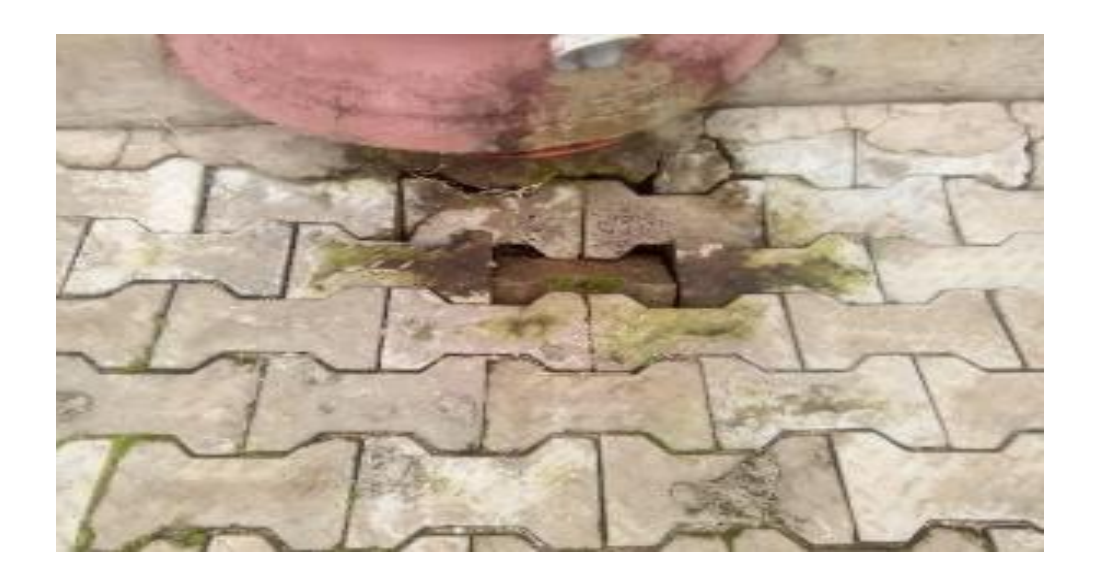
Plate 1b: Spaces between Interlocks