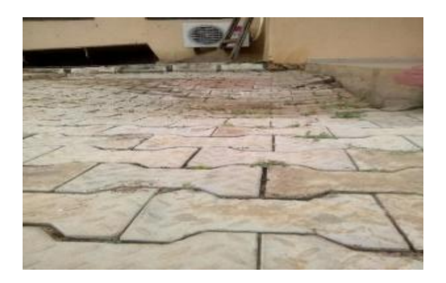
Plate 1a: Depressed Area