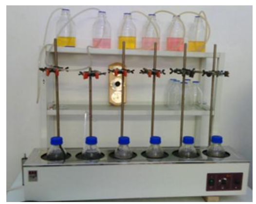
Fig. 1. Labaratory reactor system

Lucerne cultivated on contaminated land of slag and ash landfills in Tuzla together with waste sludge from Živinice municipal wastewater treatment plant and cattle manure from Spreča farm has been used in process. For the purposes of this paper, a laboratory reactor system for anaerobic digestion of organic matter with glass eudiometric pipes (manufacturer's Šurlan-Medulin), mounted on glass bottles (usable volume of 500 ml) has been used. Provision of anaerobic conditions was performed by sparging of nitrogen in order to displace the air from the reactor, while providing the required constant temperature of the reactor system at 35^{\circ}C \pm 2^{\circ}C has been carried out by heating in a water bath with circulating water (Fig. 1). Using the eudiometric pipes, the production of biogas is simple to read off, because produced gas pushes the liquid level down, while the fluid goes back into the storage bottle.